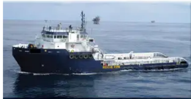
5,900 BHP ANCHOR HANDLING TUG/SUPPLY VESSEL